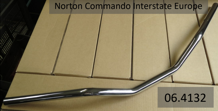
Norton Commando Interstate Europe