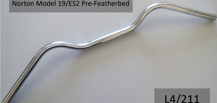
Norton Model 19/ES2 Pre-Featherbed