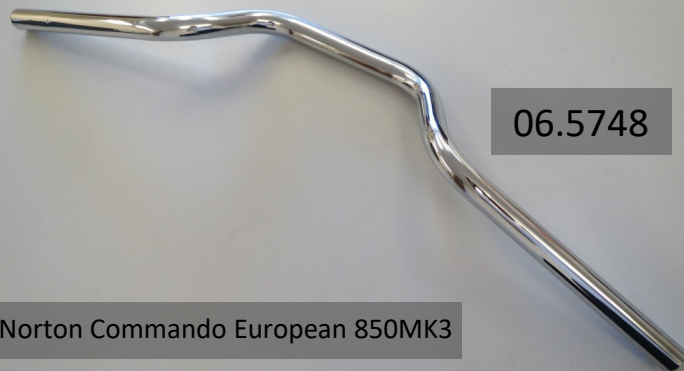
Norton Commando European 850MK3