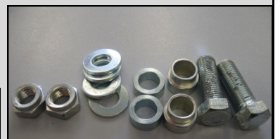
06.7311 Centre Stand Mounting Kit, Commando 71-on

Order on-line: www.andover-norton.co.uk tel: 01264 359 565 email: office@andover-norton.co.uk