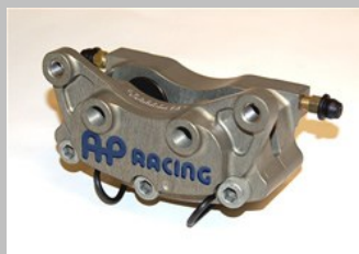
CP4227-2S0, 2 x 2 Pistons, Rear Caliper