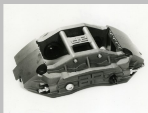
CP3345-2S4, 4 Piston, Sidecar Caliper