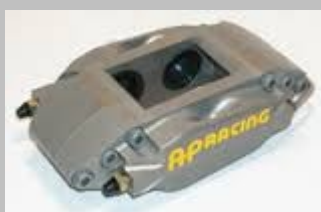
CP7030-2S0, 4 Piston, Sidecar Caliper