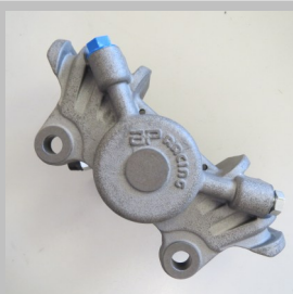
CP2696-38E0, 2 Piston, Non handed, Classic Caliper