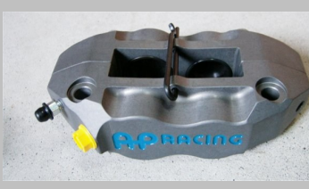
CP7853, 4 Piston, 2 Piece Radial Mount Caliper