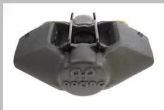
CP2577-3E0, 2 Piston, Sidecar Caliper