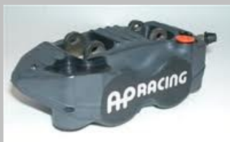
CP6688-2S0, 4 Piston, Monobloc Caliper