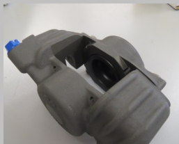
CP2195-1002E0 & 1003E0 L & R/hand Classic Caliper