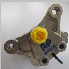
CP4226-2S0, 2 Piston, Rear Caliper