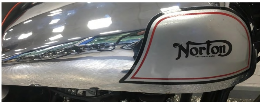
Petrol tank of a Dommi offered for sale. Nicely painted but, unfortunately, completely wrong.

The "face" of a motorcycle is to an great percentage the petrol tank. It hurts to see a bike wrongly restored, but worst is a wrongly-painted petrol tank. The worst in are normally the cammy models that are admittedly not easy to get right. That said even the normal road models are more often than not painted wrongly rather than correctly.