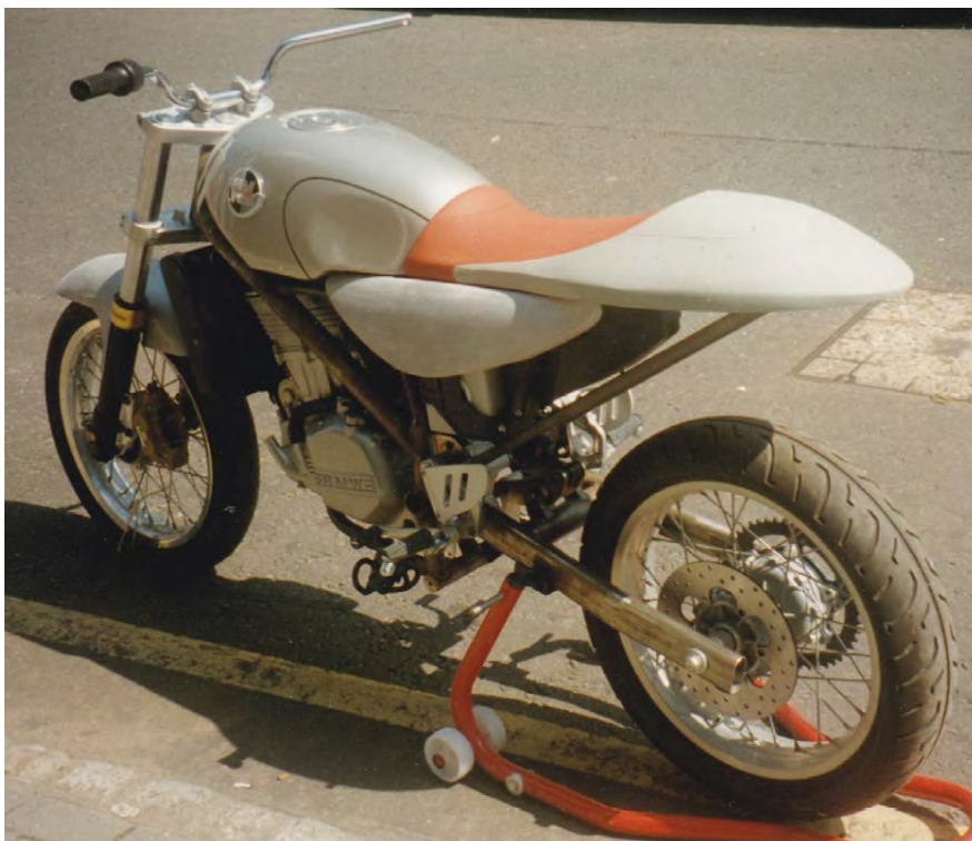
Above: first mock-up with foam seat and side panels, new contour outlined on the petrol tank.