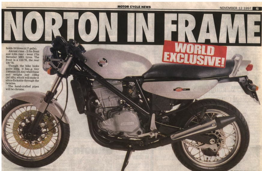
The "Ugly Duckling" as presented at the 1997 Birmingham Show