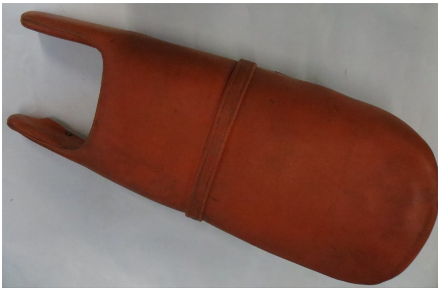
Above: The original Fastback seat I got loaned by my friend Rudi Rudisch

If you follow our “facebook” page you have probably seen my recent piece on a Fastback seat a friend lent me so we have a template for an original seat base. We have the drawing but it is always good to have an actual 3D original example in case the part was modified for production and possible changes were not documented in the drawing.