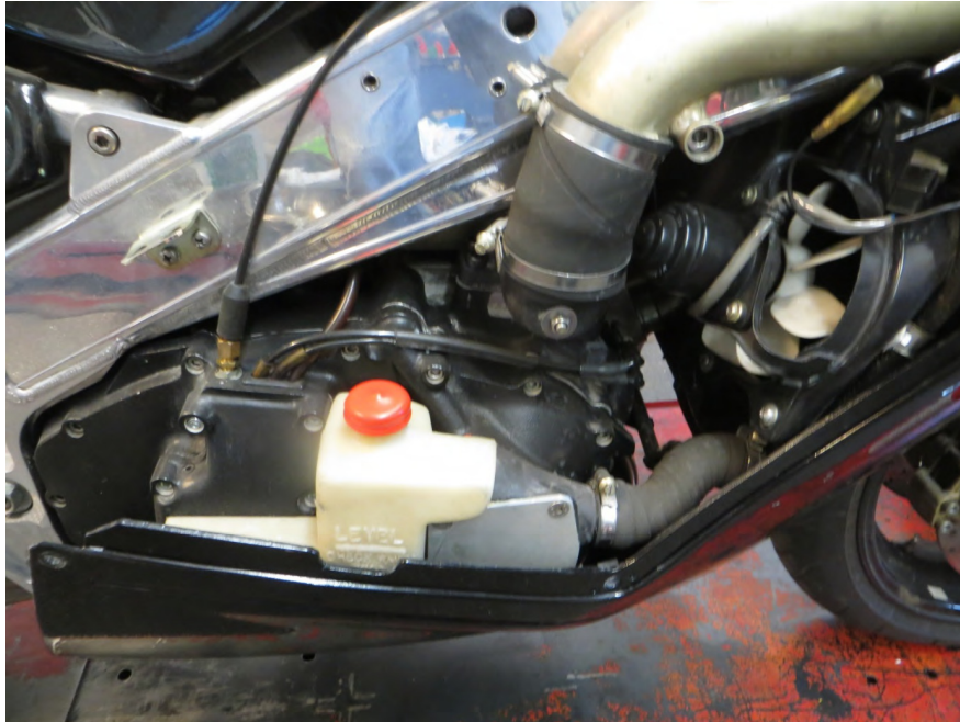
"Lydia" on the workbench. Water pump sits in front of the white plastic tank.

Since an old customer of mine was to send his Commander water pump to Andover for attention I thought I should probably do the same, hence started to get at the pump.