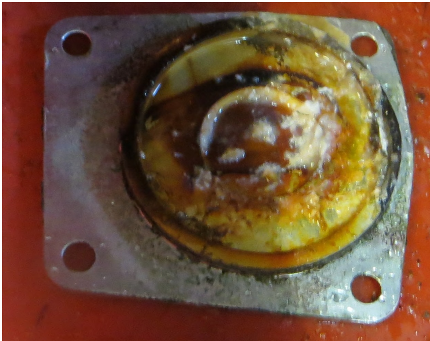
Above: Water Pump Cover with Sludge.

The back of the impeller didn't look any better, but then this is no doubt my fault.