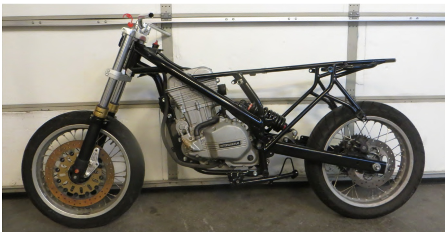
Our 1998 press bike on two wheels again after over a decade....

Since the "Source" draft took longer than anticipated due to an unexpected order overload I had another Sunday in the workshop, putting new needle bearings and seals in the swinging arm, getting the swinging arm back into the frame (handmade frame, remember? Not everything lines up perfectly at a first attempt!) plus the cantilever rear suspension and the rear wheel. Again, searching for certain parts in the bins neglected for over a decade took more time than anticipated, but in the end I got everything together and it was rewarding to have the poor old press bike on its own two wheels again after all these years. Next will be an overhaul of the carbs and installation of airbox and carburetors. Meanwhile the headlamp brackets are away for welding the instrument console brackets on.