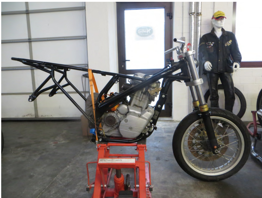
The C652 starting to look a bit more like a motorcycle. Dummy in background sports my old leather jeans from the 1970s and my old Barbour "Leonid Breschnew Replica" jacket with the masses of now vintage pins and stickers.

Since the "Source" draft took longer than anticipated due to an unexpected order overload I had another Sunday in the workshop, putting new needle bearings and seals in the swinging arm, getting the swinging arm back into the frame (handmade frame, remember? Not everything lines up perfectly at a first attempt!) plus the cantilever rear suspension and the rear wheel. Again, searching for certain parts in the bins neglected for over a decade took more time than anticipated, but in the end I got everything together and it was rewarding to have the poor old press bike on its own two wheels again after all these years. Next will be an overhaul of the carbs and installation of airbox and carburetors. Meanwhile the headlamp brackets are away for welding the instrument console brackets on.