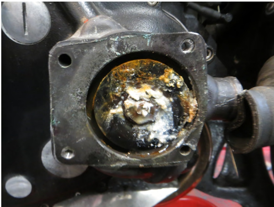
Oh Dear! Impeller doesn't look like it was fit to pump water.

The back of the impeller didn't look any better, but then this is no doubt my fault.