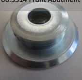
06.5514 Front Abutment