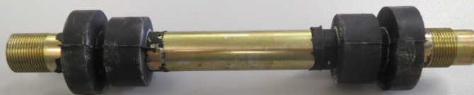
06.6126 Rear bonded rubber mounting