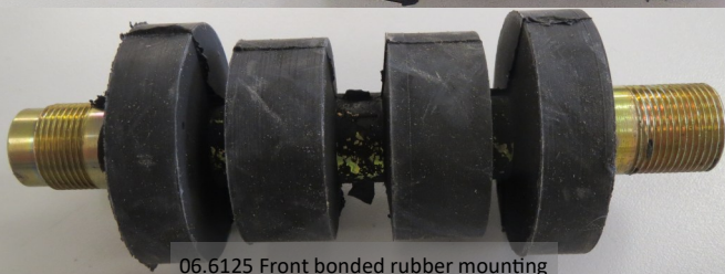
06.6125 Front bonded rubber mounting