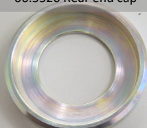
06.5526 Rear end cap