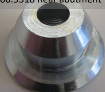
06.5518 Rear abutment